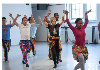
Photo caption 1: The recently completed Lewis Arts complex will be at the center of a campus-wide Festival of the Arts at Princeton University to celebrate the opening of this new arts venue