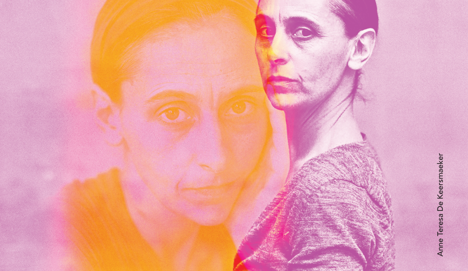
Anne Teresa De Keersmaeker