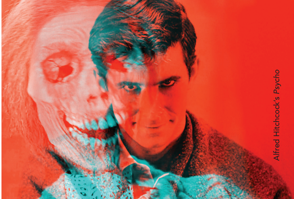
Alfred Hitchcock's Psycho

Douglas Gordon's 1993 art installation consists entirely of Alfred Hitchcock's classic and disturbingly violent 1960 film slowed down to approximately two frames per second and exhibited as an object in space. As a result, a full viewing of the film lasts for exactly 24 hours. This installation marks the 24th anniversary of the artwork, which will be screened for 24 days. FREE